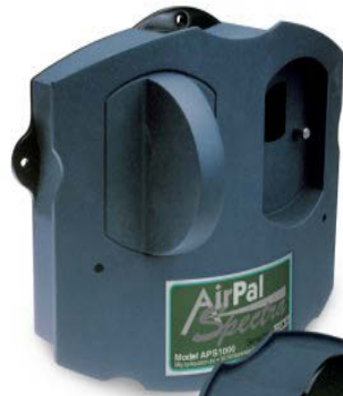
The AirPal Spectra is available in two models - ozone and non-ozone

Safe, effective, without chemicals, tested and environmen- tally friendly UV light technology