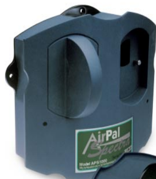
The AirPal Spectra is available in two models - ozone and non-ozone

Safe, effective, without chemicals, tested and environmen- tally friendly UV light technology