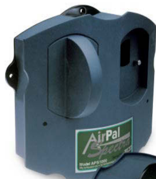
The AirPal Spectra is available in two models - ozone and non-ozone

Safe, effective, without chemicals, tested and environmen- tally friendly UV light technology