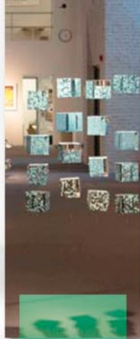
Modern & Electronic Productions