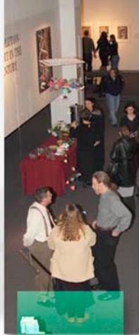
B.K. Smith Gallery