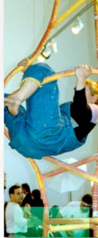
24 Hours of Making Art