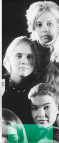
C.K. Rickel Theatre