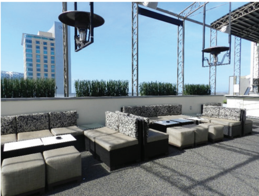
Figure 2: The Altitude Sky Lounge in San Diego, CA. 3,440 square feet of Rubberway multi-purpose installation features a custom blend of colors selected to fit with the current furniture and ambiance and provides sound dampening to the floors below. This surface replaces the previous USSA rubber surface that was in place for ten years.

resilient and will not become brittle with exposure to air. It prevents the sound transmission of foot traffic to the floors below and effectively deadens the transmission of interior noise. This recycled rubber underlayment can also be used as a crack suppressant for concrete floors.