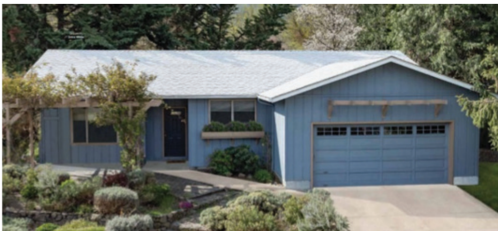
Figure 3: Ecoasis™ Costa is an architectural shingle featuring solar reflective granules similar to standard shingle colors and fortified with Nexgen™ asphalt made with recycled rubber.

has been utilizing SBS rubber polymer technology to modify their asphalt roofing for 30 years. As opposed to conventional oxidized asphalt, these composite shingles work cohesively to add strength and flexibility, as well as fortify the surface of the product. Nexgen™ polymer modified asphalt combines the existing Flexor™ with post-consumer or post-industrial reclaimed content, including recycled rubber polymers ( figure 3 ). Polymer modified asphalt is exclusively blended for several of their shingle lines.