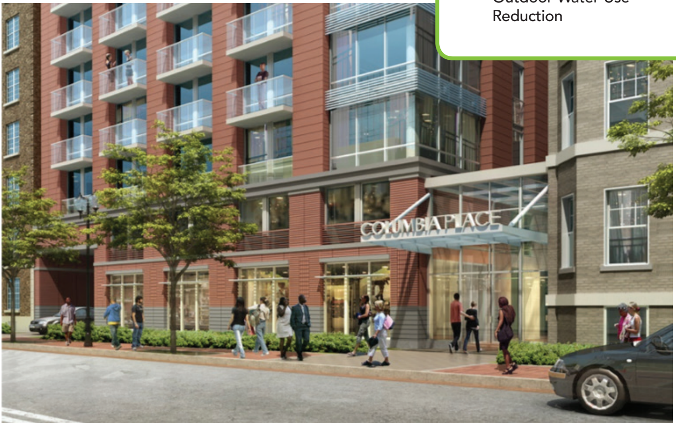
Figure 1: The Columbia Place Hotel and Condominiums in Washington D.C. placed over 1,180,000 ft 2 of 5mm QuietSound Acoustic Rated Underlayment, utilizing an estimated: 145,000 lbs. of California Crumb Rubber.