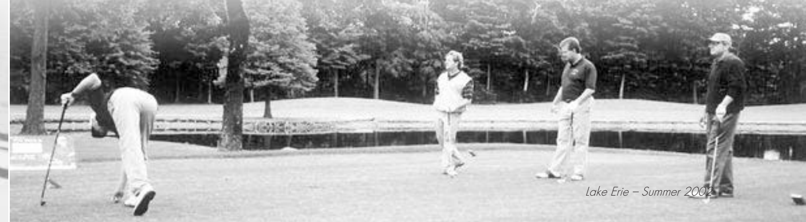
Lake Erie – Summer 2002