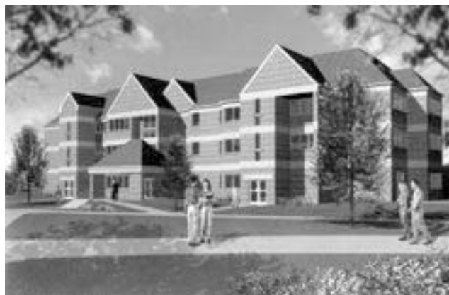
Tracy Dickinson Hall was dedicated in May.